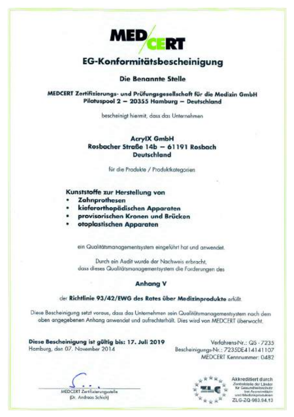
93/42/EWG Anhang V

Our goal is to deliver high-quality products that meet the safety and quality requirements of each individual to the highest degree, while maintaining an optimal price / performance ratio.