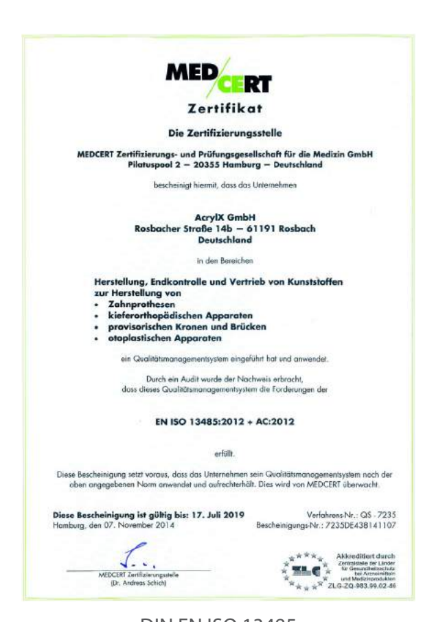
DIN EN ISO 13485

When it comes to quality, we at AcrylX® make no compromises - because it's about your safety as a user and the health of your customers and patients.